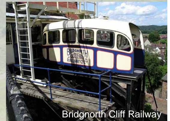
Bridgnorth Cliff Railway