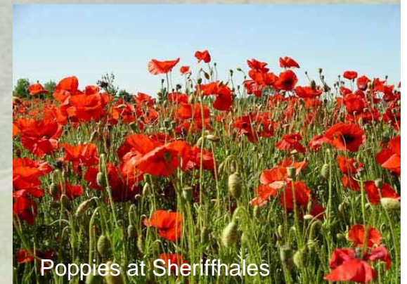
Poppies at Sherifhales