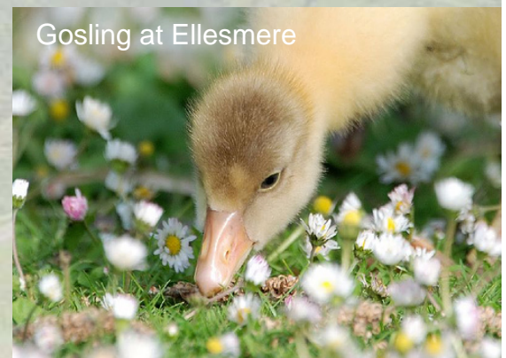
Gosling at Ellesmere